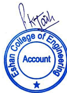
Director Eshan College of Engineering Farah, MATHURA